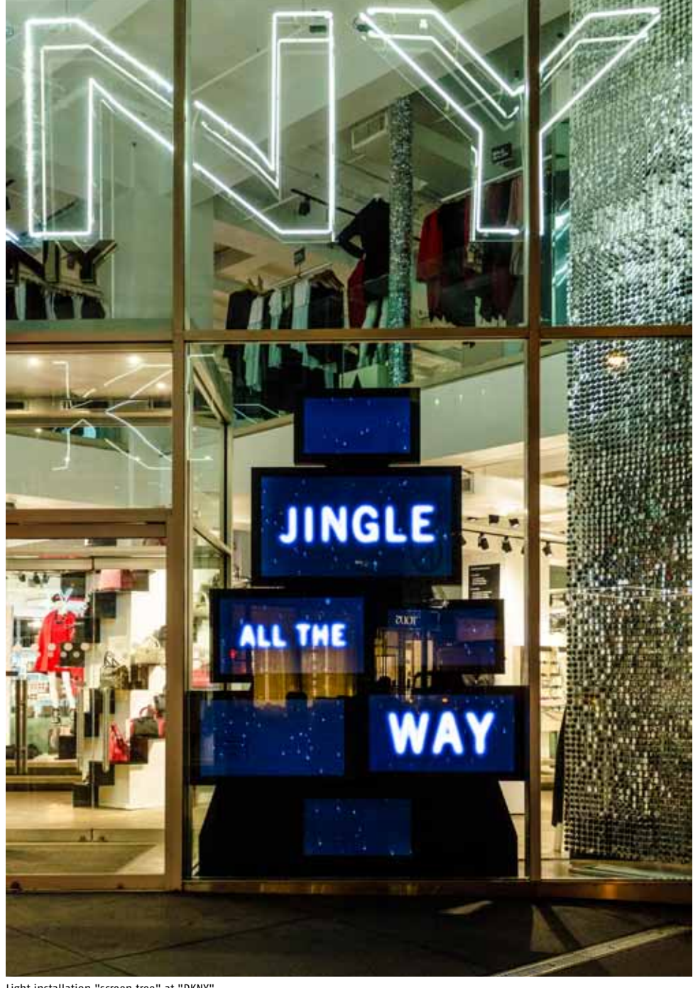
Light installation "screen tree" at "DKNY"