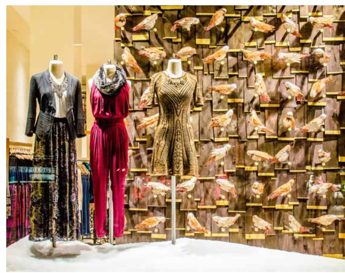
Trend "Nature Configuration" implemented in the shop window of Anthropologie

"Metamorphosis" is a development that clearly concentrates on subjects like science, evolution and research. Molecules, crystals, ornaments – the finest natural structures play the lea-