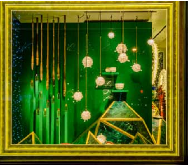
Trend "Metamorphosis" at Hermes

the big department stores use "Modern Myth" this year. Barneys presents oversized mushrooms and dancing elves in combination with a ghetto blaster. Macy's takes the observer on a trip through the planetary system. Bergdorf Goodman likes it frosty: a mannequin is draped in a world of ice, surrounded be ice sculptures of different animals. But also international chain stores like Massimo Dutti use it: A centaur is presented, a fabulous mixture of a human being and a horse from Greek mythology.