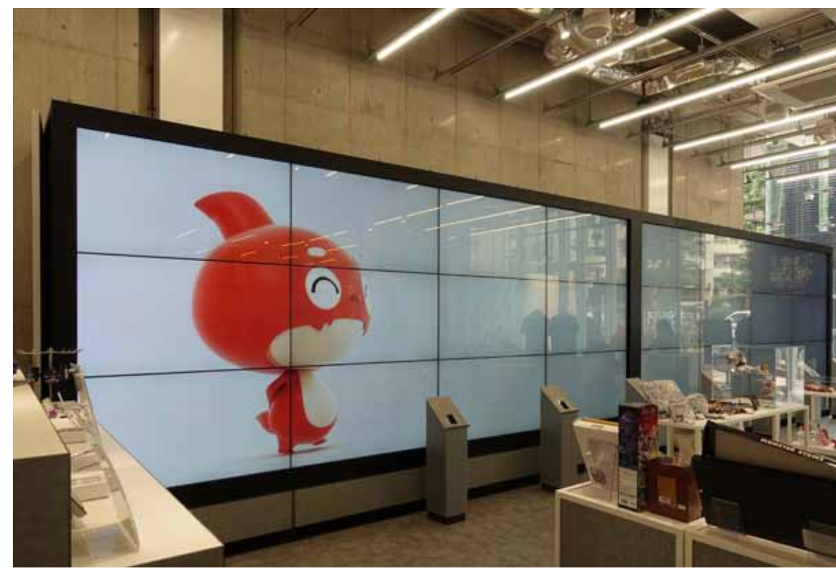
The XFLAG customer can browse through the product range at a huge screer

of trading necessary – especially retail and its visual merchandising." If everything turns out well, something new and wonderful is about to arise. This seems to be the only way for retailers to face the future. "Tokyo's flagship stores are showing that exactly this transformation can be done in an exemplary manner", says Spanke. Whether if it's a luxury label, an electronic paradise or brands for the youth culture, Tokyo pushes digital trends pro-active and comes up with innovative approaches for new shopping experiences.