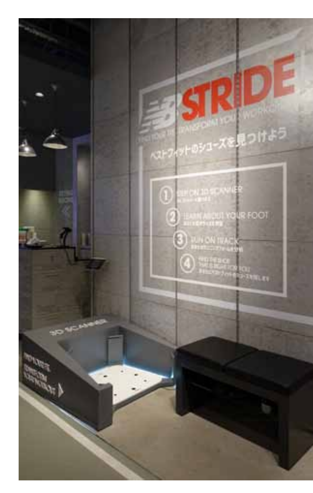
Asics` measurements are the basis for product recommendations

products as well. Natural wood, plants and simple concrete elements restage the latest technologies quite appealing.