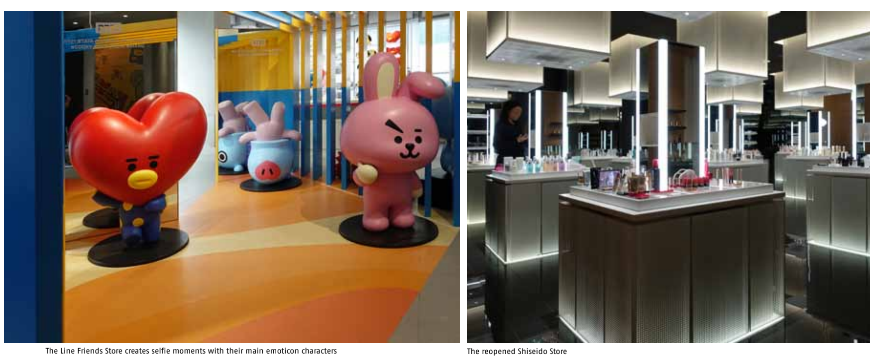
The Line Friends Store creates selfie moments with their main emoticon characters

tures. Rigorously implemented: The store design has been inspired by single steps of putting on make. The layer aesthetics is arranged through the flour levels. On the ground floor as well as on the first floor are sales areas for cosmetic products. Besides, the first floor houses a Skin Care Salon. One level higher is a photo studio, a hair salon and make-up salon. On the fourth floor a private area for cosmetic treatments and a café are waiting for "Members